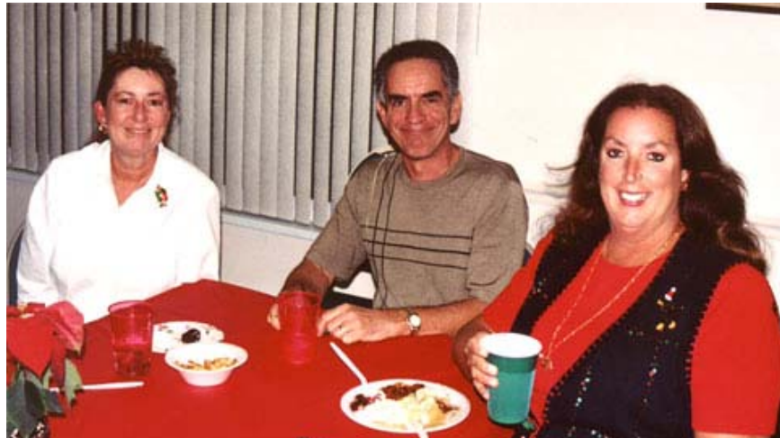
Picture of the month. Christmas Party 2004

Submit your photos for the Page One Shot to newsletter@usadiveclub.com